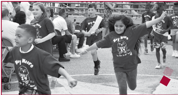
May Moore Primary School