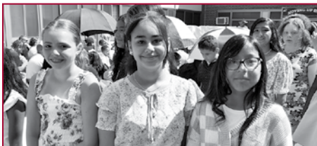
John F. Kennedy Intermediate School