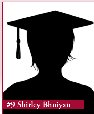
#9 Shirley Bhuiyan