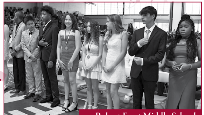
Robert Frost Middle School