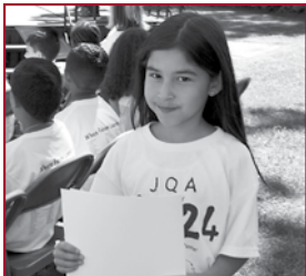
John Quincy Adams Primary School