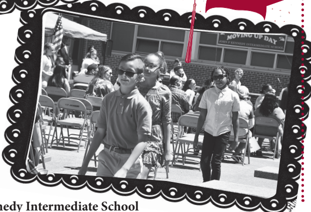
John F. Kennedy Intermediate School