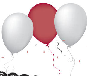
John Quincy Adams Primary School