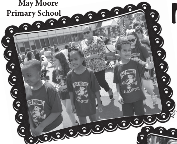
May Moore Primary School