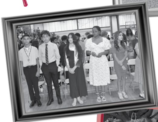
Robert Frost Middle School