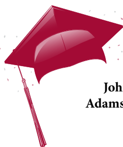
John Quincy Adams Primary School

Continuing a beloved senior walk tradition begun in 2018, Deer Park High School students from the Class of 2022 visited their respective primary schools on June 21, speaking to second graders from John Quincy Adams Primary School and May Moore Primary School and reconnecting with their old teachers.