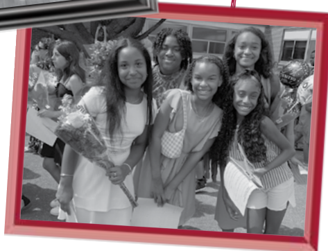
John F. Kennedy Intermediate School