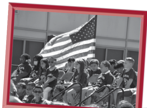
May Moore Primary School