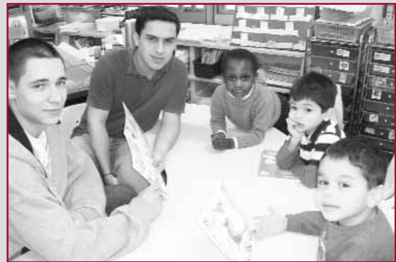
Deer Park High School students enrolled in the College Software Applications class worked with May Moore kindergartners to develop their literacy skills and positive character traits.

The project enabled the older students to refine their technology, writing and artistic skills and work collaboratively with the youngsters to help inspire them to read, write and cultivate their own positive character traits.