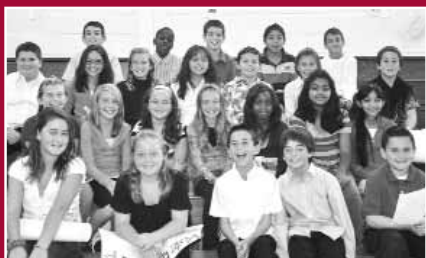
Twenty-four JFK fifth grade students vying for school office, campaigned for weeks.

This fall, students were immersed in the democratic process through some educational election experiences to remember.