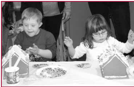
John Quincy Adams Elementary students demonstrated their culinary creativity and basic architectural skills by building gingerbread houses.

Laying a foundation of white icing, students created M&M windows, gumdrop doors, and even fences with licorice landscapes.