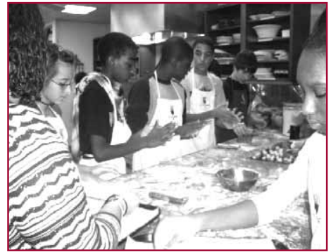
Robert Frost Middle School Cultural Foods students get a hands-on lesson in cooking and baking.

After a day of baking, broiling, and sautéing, students sampled their meals, critiquing taste and presentation while reflecting on each step of the cooking process. At the end of the savory meal, they brought their recipes home so that they can perfect their dishes and share their talent with friends and family.