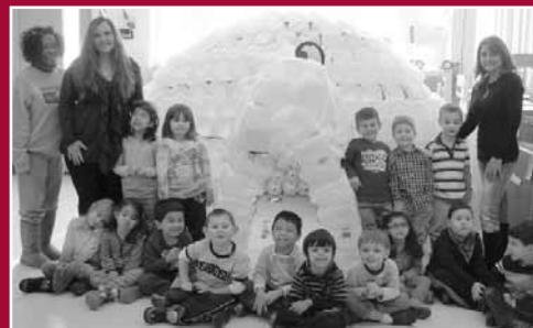
Abraham Lincoln pre-kindergarten students helped construct an igloo made from used milk jugs. Students completed winter activities and learned about Arctic animals and habitats.

Following the winter unit, the Town of Babylon visited the school to pick up the milk jugs and transported them to the local recycling center.