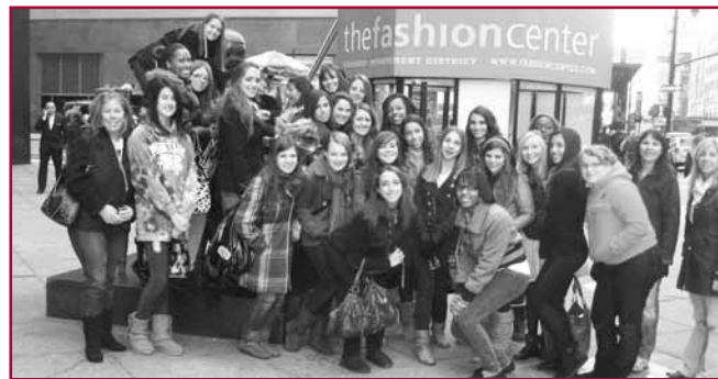
High school Fashion Marketing students had the opportunity to visit iconic places in New York City's Garment District, including the Fashion Walk of Fame and Mood Fabrics, as featured on Project Runway.

The hands-on field trip connected textbook concepts to real-life events and allowed students to learn the business of fashion.