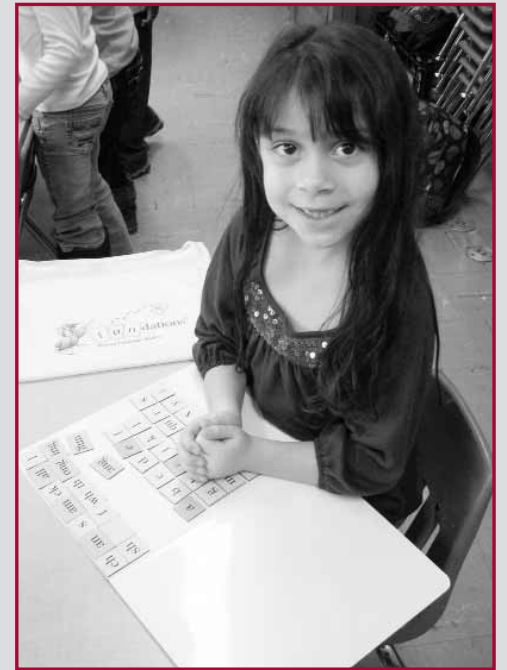
During their Foundations lessons, a John Quincy Adams Elementary student sounds out and spells words using movable letter tiles.

Partnering with members of the Board of Education and district administration, the students explained the five main components of being a successful reader and demonstrated the instructional tools being utilized during their spelling and reading lessons. The Board members and administrators had the opportunity to use magnetic letter journals and erasable gel writing boards included in the Foundations program and experienced some of the learning activities firsthand.