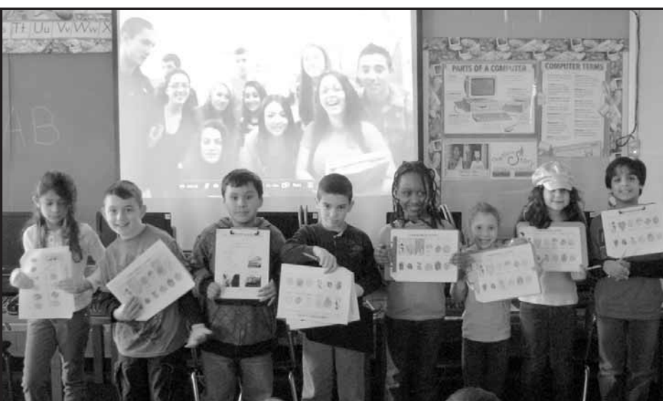
High School World Languages students used Skype technology to connect with and teach district elementary students at John Quincy Adams.

District schools came together to explore language during the district's World Languages Videoconference.