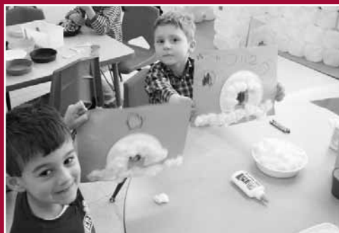
In conjunction with their winter unit, Abraham Lincoln pre-kindergarten students created artwork, went ice fishing for letters and numbers and read books on the Arctic while inside their milk-jug igloo.