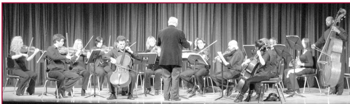
String music students joined fellow student-musicians to enjoy a concert performed by the Metropolitan Chamber Orchestra at the district's high school.