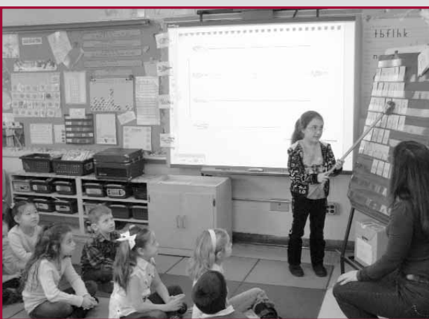
District elementary students utilize the SMART Board and letter board during their Foundations literary lessons.