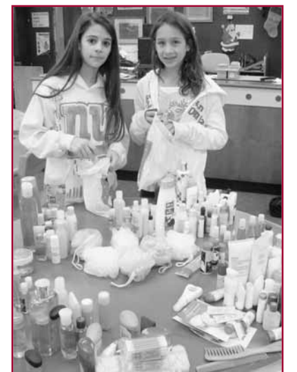
Robert Frost Middle School Student Council members collected, sorted and packaged toiletry items for their "Soaps for Seniors" project.

Robert Frost Middle School Student Council held their annual "Soaps for Seniors" program. The unique community service project aimed to collect personal care items for the residents of Our Lady of Consolation Nursing and Rehabilitation Care Center. Thanks to the generous donations made by the school's students and faculty members, each resident received a gift bag filled with essential personal care items. During the drive, the students collected a variety of toiletry products, such as lotion, toothpaste, combs, shampoo, cotton swabs and body spray. Student Council members came together to sort and create individual care packages for the senior citizens.