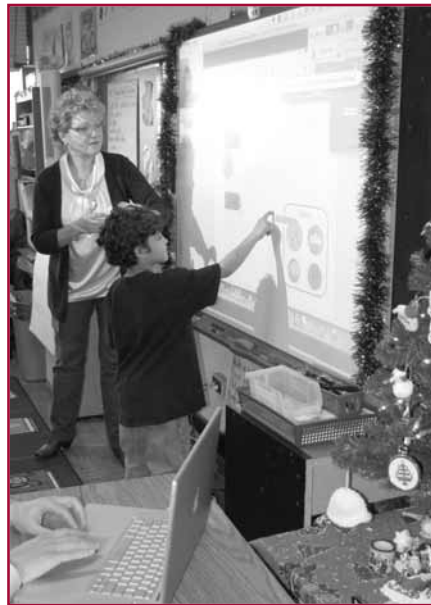
High school students instructed May Moore Elementary School students in money lessons through videoconferencing technology using classroom SMARTBoards.

The high school and May Moore Elementary School combined instructional technology tools and educational resources to provide students districtwide with a unique learning opportunity. In a program introduced as "Bridging SMARTBoards