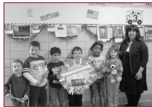
May Moore Elementary students created a "Wall of Heroes" to showcase the men and women in their lives who have served in the United States Military.