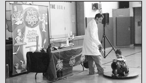
John Quincy Adams Elementary School students experienced science in motion, riding a Hover Craft and learning how it was built and works to transport items and people.