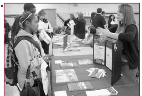
A Deer Park student spoke with a college representative and collected information at the district's annual college fair.

Students throughout the district attended the High School's 7th Annual College Fair in April. More than 100 schools, vocational training programs and military service academies were represented at this informative event, which also featured admissions test prep centers and financial aid organizations. Students and their parents had the opportunity to speak with educational professionals and discuss school-specific questions, including academic structure and campus life. In addition, various resources for the college search and application process, as well as helpful career information, were available.