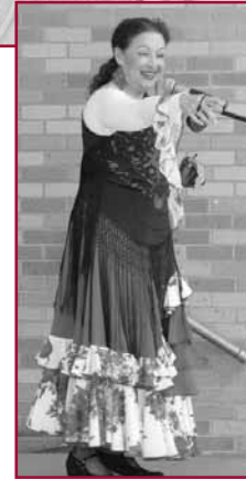
Robert Frost students tasted Dominican, Salvadorian and Spanish foods from local restaurants and learned cultural dances at the school's Hispanic Heritage event.