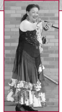
Robert Frost students tasted Dominican, Salvadorian and Spanish foods from local restaurants and learned cultural dances at the school's Hispanic Heritage event.