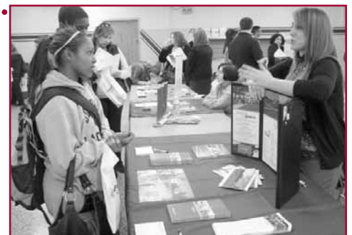
A Deer Park student spoke with a college representative and collected information at the district's annual college fair.

Students throughout the district attended the High School's 7th Annual College Fair in April. More than 100 schools, vocational training programs and military service academies were represented at this informative event, which also featured admissions test prep centers and financial aid organizations. Students and their parents had the opportunity to speak with educational professionals and discuss school-specific questions, including academic structure and campus life. In addition, various resources for the college search and application process, as well as helpful career information, were available.