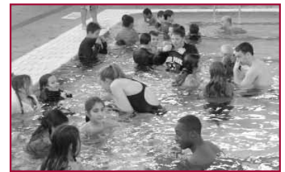
Lifeguards and physical education teachers assisted John F. Kennedy Intermediate School students as they practiced valuable survival techniques in the district's pool while fully clothed.

While clothed, students entered the pool to simulate emergency scenarios and practice survival techniques, including floating, swimming, huddle positions, using clothing as flotation devices, and understanding the importance of lifejackets. Students also learned how to handle unusual circumstances, such as a submerged vehicle or capsized boat.