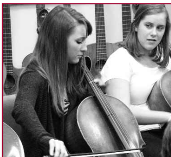
Student cellists prepared for a joint concert with Project Trio, honing their musical skills.