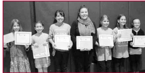
Elementary students and their parents, attended the "Parents, Educators and Kids" musical workshop.