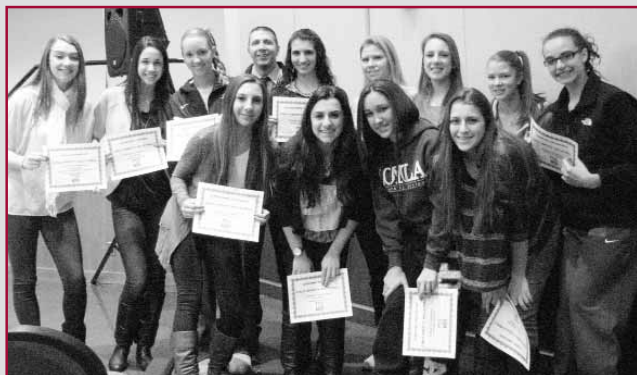
The Girls Varsity Volleyball team, along with other fall teams, received award certificates for their academic and athletic accomplishments.

Following a successful fall season, the district is proud to announce that eight teams have earned New York State Scholar-Athlete status. In order to receive this designation, the teams achieved and maintained a cumulative grade point average of 90 or better throughout the entire season. In addition, two varsity teams and the Robert Frost Middle School seventh-grade boys soccer team received the Sportsmanship Award for their respective leagues. These teams were selected for this award based on the recommendations of officials and opposing teams for their fair play and good sportsmanship on the field of competition.