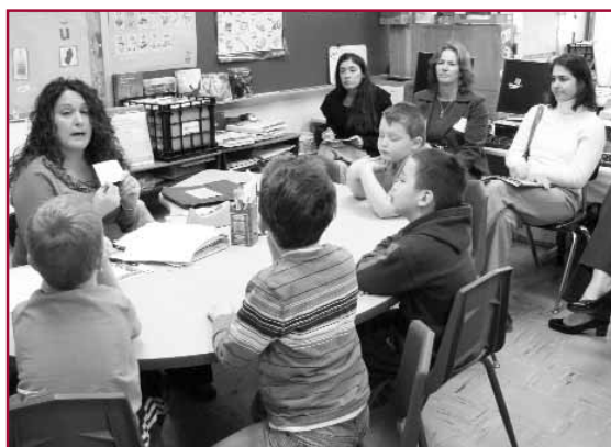
May Moore students received individualized literacy lessons as Bridgehampton educators observed teacher practices in Foundations, Leveled Literacy Intervention, Double Dose and Reading Recovery as part of the Model School Program.

Faculty have shared their time and resources to assist Bridgehampton in developing a model that supports students in need of academic or behavioral support