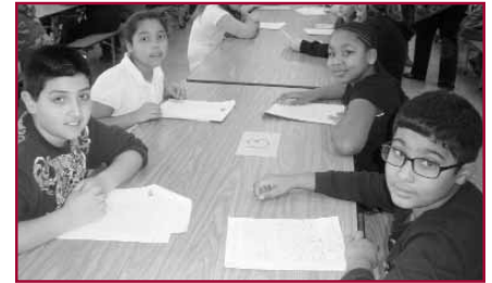
John F. Kennedy Intermediate School students were able to express their unique perspectives and creative ideas through the fourth-grade Realistic Fiction Writing Celebration.

In order to showcase their work, fourth-grade students came together for a culminating Realistic Fiction Writing Celebration. Students were grouped together to share their writings with their peers and provide positive feedback to one another.