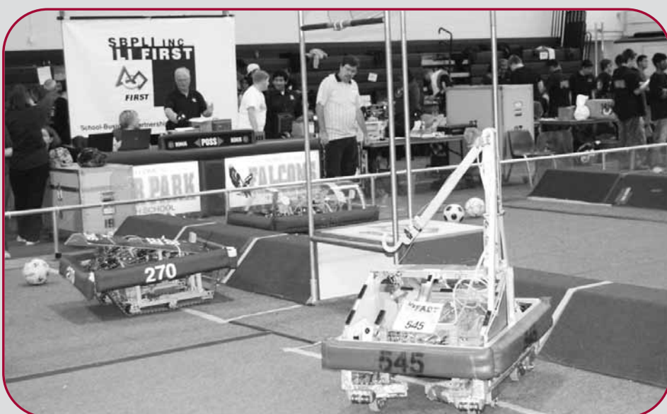
The High School Robotics Team designed, built and controlled Robot 270 for the Deer Park Invitational.

At the event, students programmed their robots to compete on a 27-by-54-foot playing field setup in the high school's gymnasium and attempted to earn points by collecting soccer balls in goals. Additional bonus points were earned for each robot suspended in air and not touching the field at the end of the match.