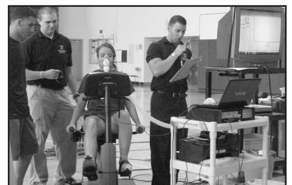
Student-athletes participated in VO2 Max Cardiovascular Testing to improve their endurance and performance based on scientific research.

The program was designed to raise awareness of the benefits of cardiovascular health among Deer Park High School students and to help them understand fitness levels based on sport-specific and individual characteristics.