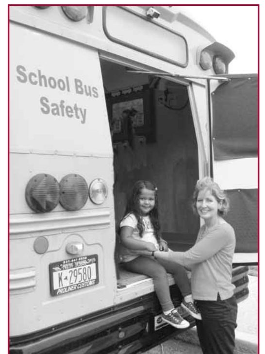
Abraham Lincoln pre-kindergarten students practiced emergency bus drills exiting from the rear of the Safety Sally bus.

Safety Sally, facilitated by Eastern Suffolk BOCES, is an interactive program that provides training on school bus safety and awareness aboard the safety bus mobile classroom. Students were instructed on all phases of school bus safety beginning with bus stop behavior and proper crossing and boarding. They also learned how to secure their seatbelts, along with the roles of the driver and passengers. At the conclusion of the program students simulated routine and emergency exiting procedures and viewed bus danger zones.