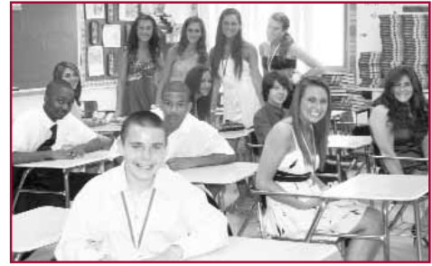
Robert Frost Middle School students graduated from eighth grade and will spend the summer preparing for high school.

To conclude both ceremonies, students were presented with certificates from Board of Education members and school administrators.