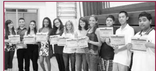
High school business students were awarded scholarships from MSG Varsity and recognized by the community at a Board of Education Meeting.

Prior to shooting and producing content for the channel, students learned about effective and responsible communication in an increasingly multimedia world. MSG Varsity provided students with the technology necessary to create segments and demonstrated how to properly edit and effectively present events and news.