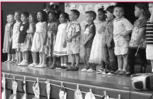
Abraham Lincoln Pre-Kindergarten students performed songs and dances on the school's stage, which was decorated with personalized paper cutouts of themselves for their end-of-year celebration.