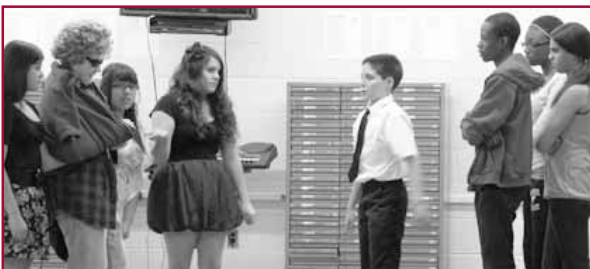
Robert Frost Middle School theatre students brought the New York City Student Shakespeare Festival to the high school's stage, acting out scenes of love, death and tragedy from the iconic playwright's A Midsummer Night's Dream and The Merry Wives of Windsor .

District teachers directed Frost students in acted-out theatrical pieces, including a collection of scenes from Shakespeare's A Midsummer Night's Dream and The Merry Wives of Windsor . Prior to making the trip into New York City, students learned how to properly articulate the Shakespearian language and convey the culture and historical time periods in which the various works took place. This included rehearsing voice tone, body language and character interaction.