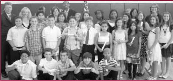
John F. Kennedy Intermediate students displayed their moving-up certificates and were joined by Board of Education members, teachers and administrators.