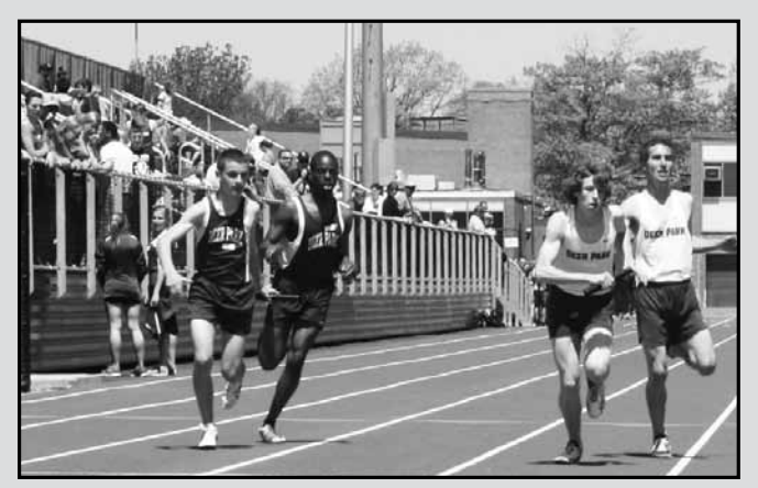
The high school's two relay teams competed in the 4x400 relay at the debut Deer Park Falcons Track Invitational.