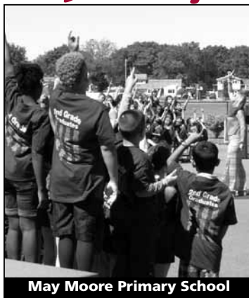
May Moore Primary School