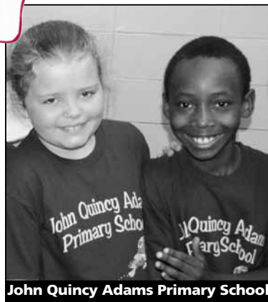
John Quincy Adams Primary School