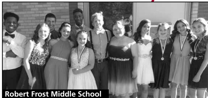
Robert Frost Middle School