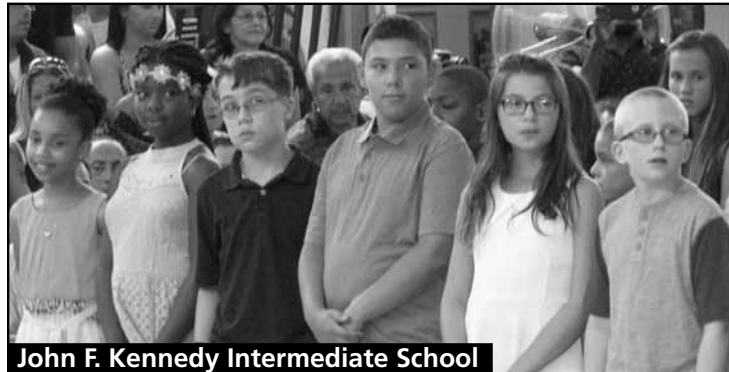
John F. Kennedy Intermediate School